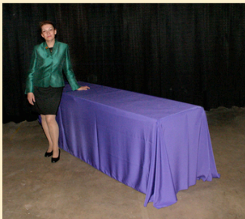
TABLE DRAPES & Runners